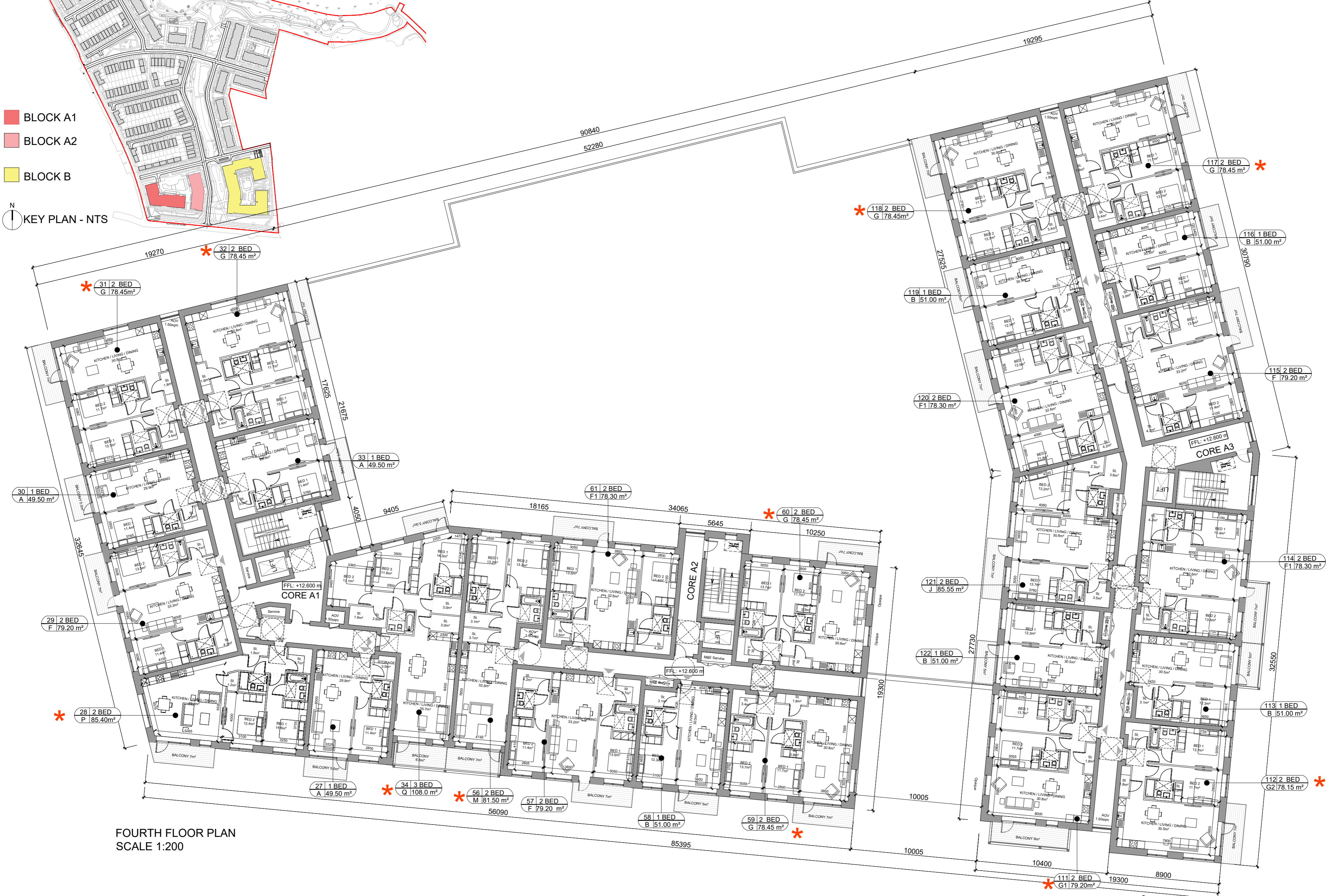
FOURTH FLOOR PLAN SCALE 1:200