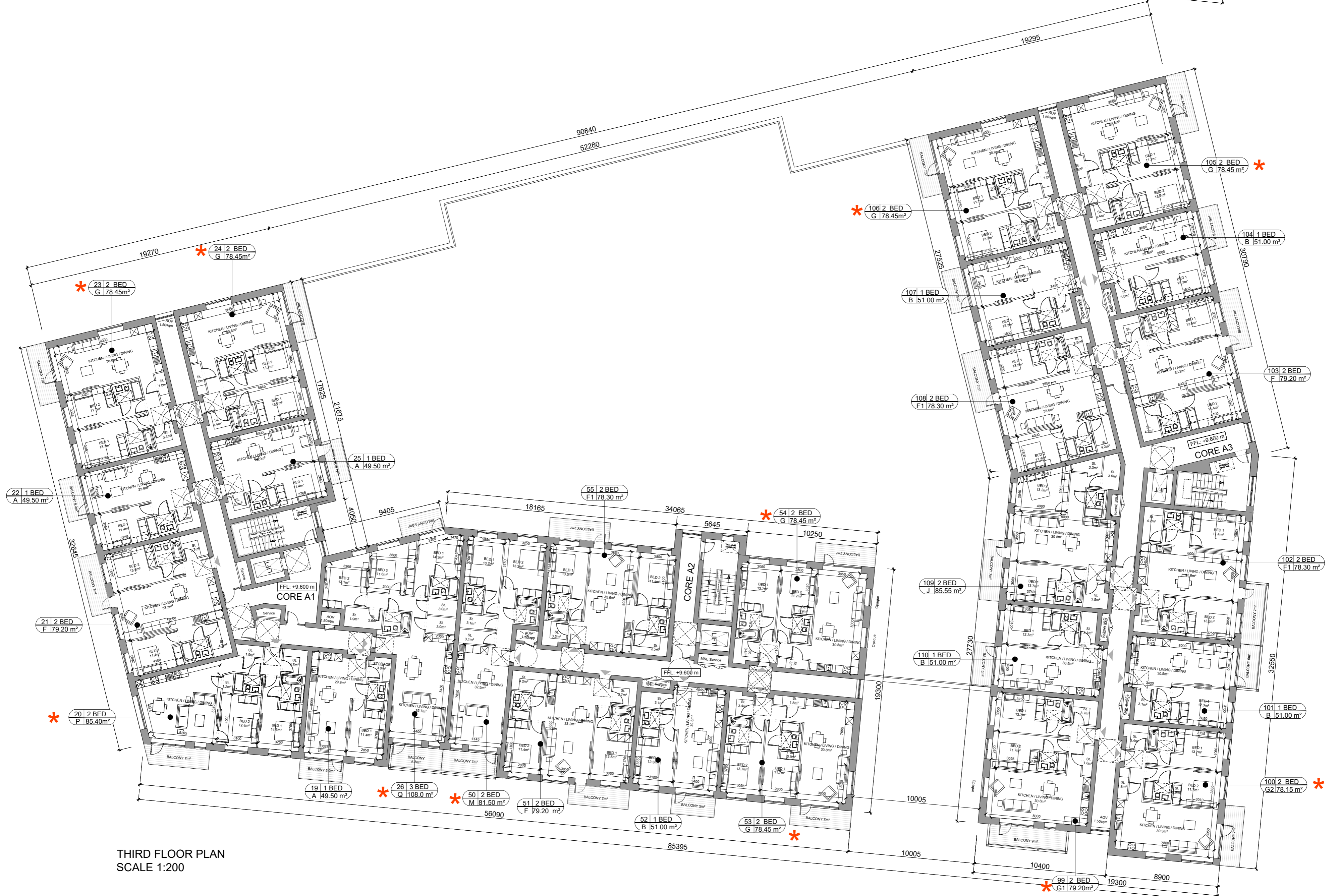
THIRD FLOOR PLAN SCALE 1:200